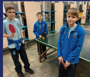
Table Tennis and Badminton